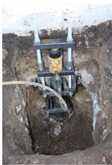
Hydraulic jack used to lift the structure