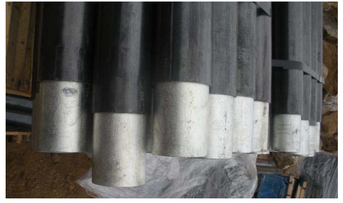
Couplings are crimped at one end of each pipe pile

Pipe sections shipped in standard 24 piece bundle.